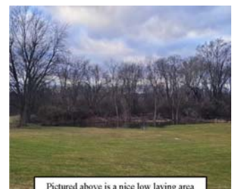
Pictured above is a nice low laying area that if it remains wet when spring rolls around would be a prime location for mosquito larvae to hatch

Churchtown Church of God Yard Sale will be June 22, 2024 from 7AM until 2PM.